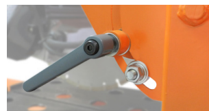
ADJUSTABLE CUTTING-DEPTH HANDLE