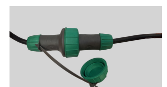
EASY WATER PUMP PLUG