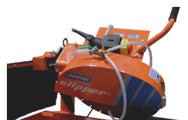
TILTING HEAD [90° - 45°]