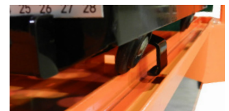
ANTI PIVOTING SYSTEM