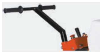
ADJUSTABLE HANDLE HEIGHT