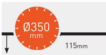
MAX CUT DEPTH