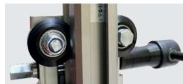
CARRIAGE GUIDING SYSTEM BY ROLLS.