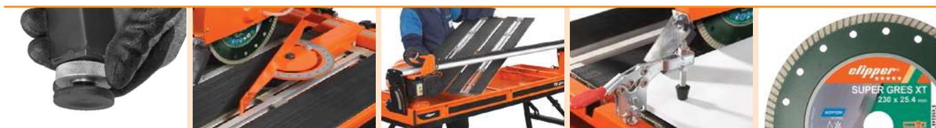
New leg stability system

Its reinforced frame and cutting head rail ensure a very precise cut. The rubber-covered table and the additional fixing clamps prevent vibrations to provide the best cutting quality.