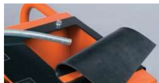
BUILT-IN WATER TANK