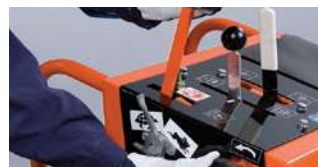
MANUAL OR HYDRAULIC RAISE & LOWER THE BLADE