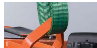
BUILT-IN LIFTING EYE