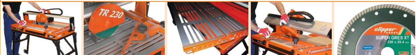
Cutting guide with angular setting

TR230GS is a professional tile saws with powerful motor (1,1kW) and cutting length adapted to large tiles (860mm).