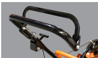
ERGONOMIC THROTTLE HANDLE