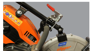
EASY MOUNTING OF THE CUT-OFF SAW