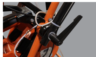
ADJUSTABLE HANDLE POSITION