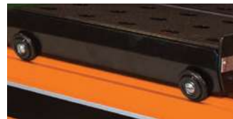
FRICTION RESISTANT TILTED ROLLERS