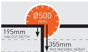
MAX CUT DEPTH - Ø500