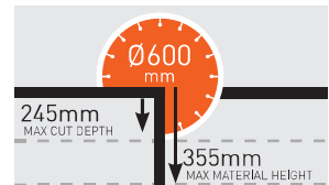
MAX CUT DEPTH - Ø600