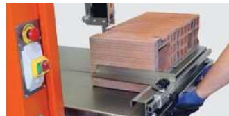
SAFETY OF USE