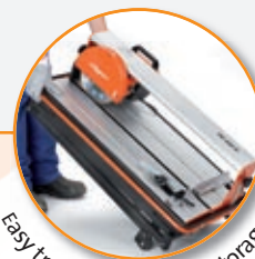
Easy transportation and storage.