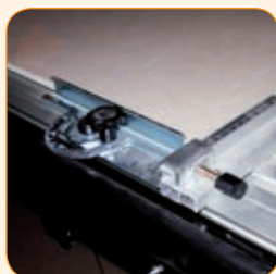
Fast and precise locking cutting guide.