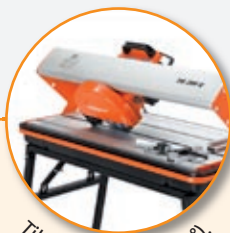
Tilting head (0° to 45°)