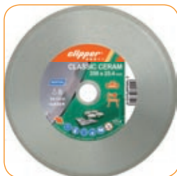
CLASSIC CERAM Ø 200 x 25,4mm