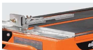
CUTTING GUIDE INCLUDED