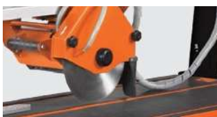
PLUNGING CUTTING HEAD