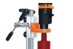
STANDARD 60MM COLLAR