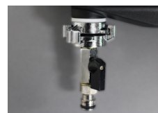
WATER INLET & DUST EXTRACTION