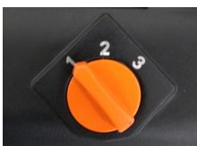
3 - SPEED GEARBOX