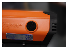
EASY ACCESS TO BRUSH