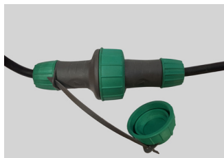
EASY WATER PUMP PLUG