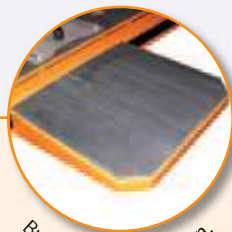
Built-in side extension.