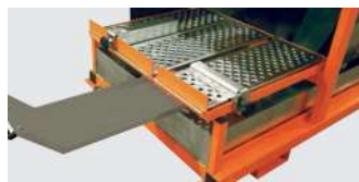
FRONT SPLASH GUARD