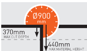
MAX CUT DEPTH - JUMBO 900