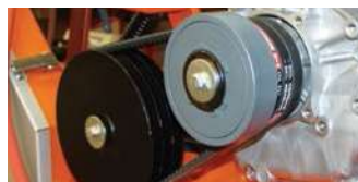
CENTRIFUGAL CLUTCH DEVICE (JUMBO P13 ONLY)