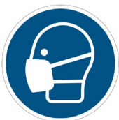
For dry cutting in exceptionally cases , wear additional dust