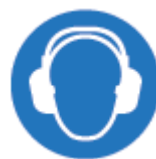
Ear protection must be worn