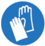
Hand protection must be worn