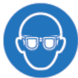
Eye protection shall be worn