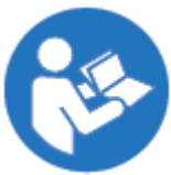
Read operator's instructions

Important warnings and pieces of advice are indicated on the machine using symbols. The following symbols are used on the machine: