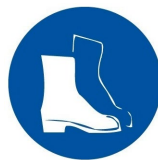
Shoes protection must be worn