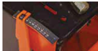
CUTTING DEPTH INDICATOR