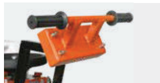
LOW VIBRATION HANDLEBAR