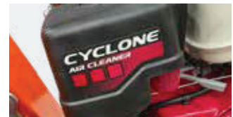
CYCLONIC AIR FILTER