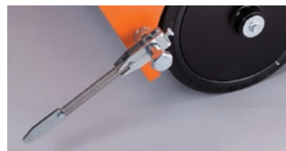
FLEXIBLE REAR POINTER