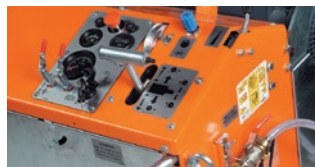
COMPREHENSIVE CONTROL PANEL