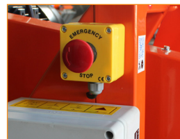
EMERGENCY PUSH BUTTON