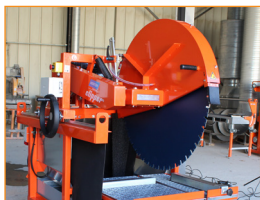
FITS 900 & 1000mm BLADE DIAMETERS