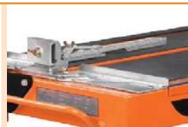
Cutting guide included