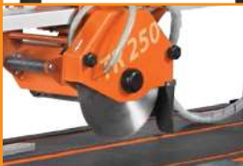
Plunging cutting head

The Clipper TR250 H is a robust and high quality machine completing perfectly our tile saws product range. Its maximum cutting length reaches 1000mm.