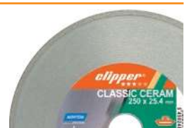
Machine delivered with a Clipper CLASSIC CERAM Ø250mm diamond blade